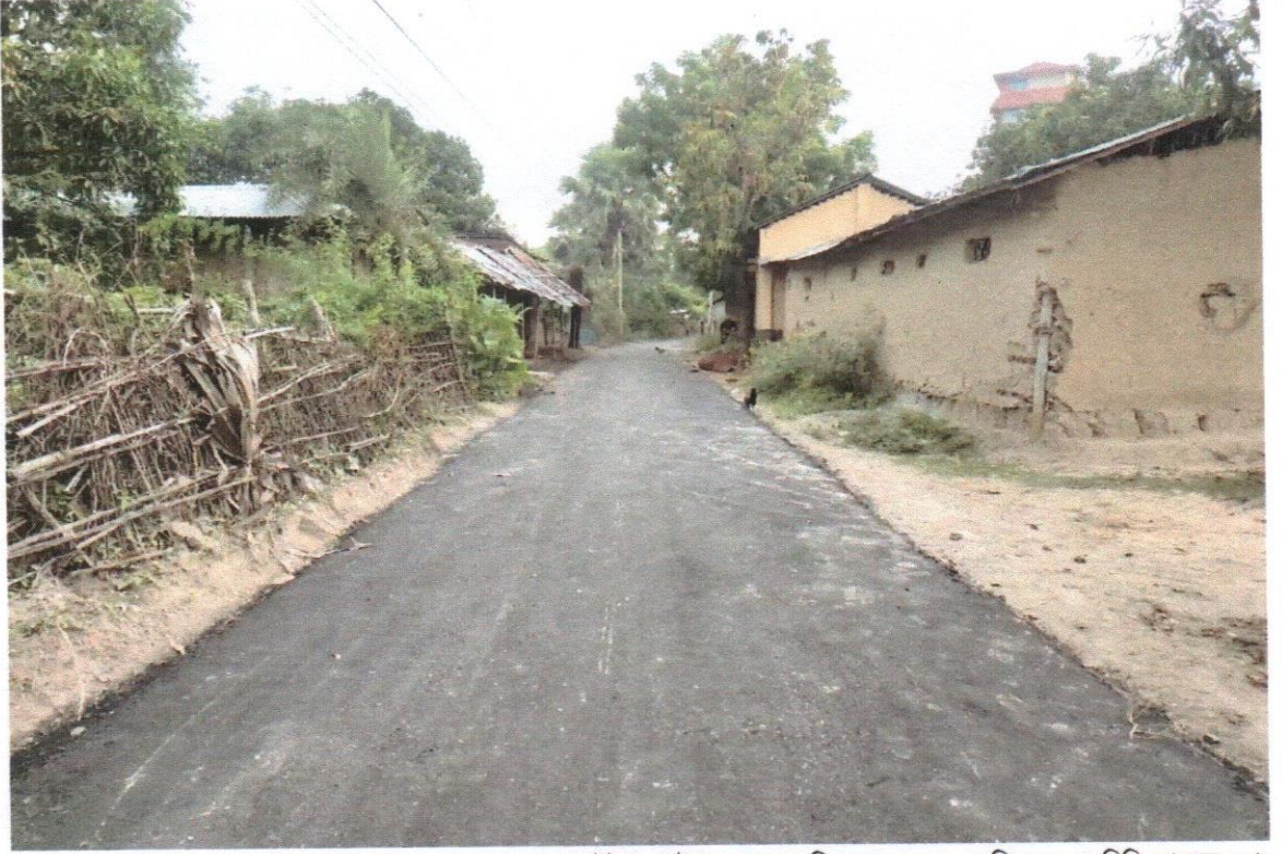
২০২১-২০২২ অর্থ বৎসরে RDRIDP প্রকল্পের আওতায় ভাটখৈর হাই স্কুল হতে দক্ষিনপাড়া জুম্মা মসজিদ রাস্তার বিসি কাজের দৃশ্য চেইনেজ-৯০.০ মিঃ আইডি নং- ১৭০৩৭৫১৬১