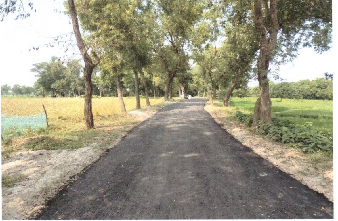
২০২১-২০২২ অর্থ বৎসরে RDRIDP প্রকল্পের আওতায় ফাজিলপুর হতে খামারবাড়ি রাস্তার বিসি কাজের দৃশ্য চেইনেজ-১০০.০ মিঃ আইডি নং- ১৭০৩৭৫০৯০