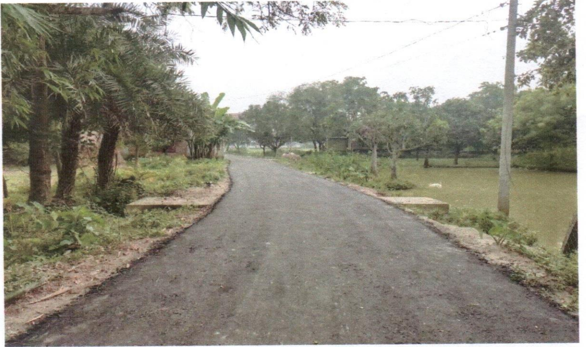
২০২১-২০২২ অর্থ বৎসরে RDRIDP প্রকল্পের আওতায় ভাটখৈর হাই স্কুল হতে দক্ষিনপাড়া জুম্মা মসজিদ রাস্তার বিসি কাজের দৃশ্য চেইনেজ-২৬০.০ মিঃ আইডি নং- ১৭০৩৭৫১৬১