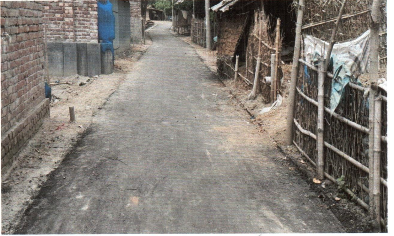
রাস্তার নামঃ RDRIDP প্রকল্পের আওতায় চৌডালা ঘাট হতে গাইদোহারা ভায়া নন্দলালপুর রাস্তার বিসি অংশের দৃশ্য চেইনেজ- মিটার রাস্তা আইডি নং- ১৭০৩৭৪০৪৫