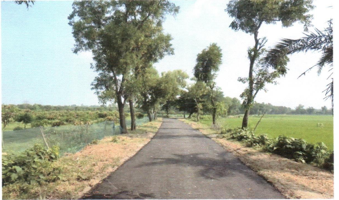
২০২১-২০২২ অর্থ বৎসরে RDRIDP প্রকল্পের আওতায় ফাজিলপুর হতে খামারবাড়ি রাস্তার বিসি কাজের দৃশ্য চেইনেজ-৩১০.০ মিঃ আইডি নং- ১৭০৩৭৫০৯০