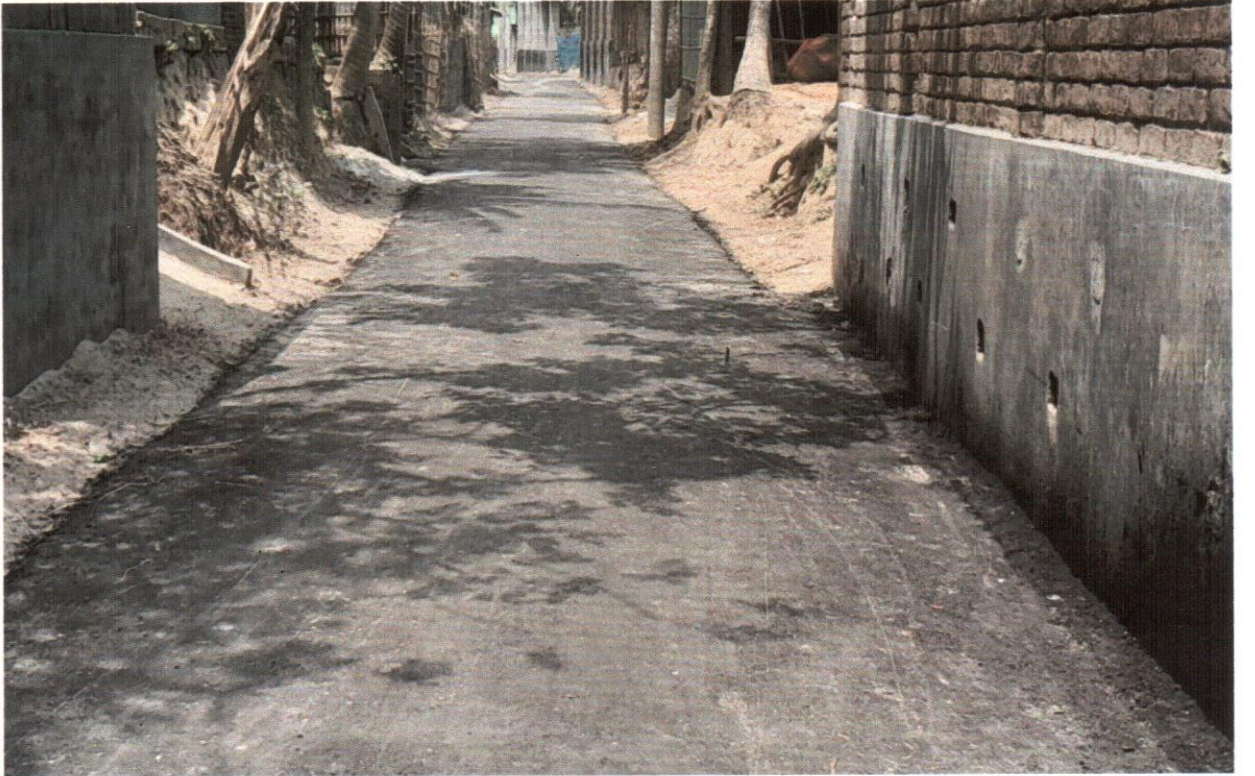
রাস্তার নামঃ RDRIDP প্রকল্পের আওতায় চৌডালা ঘাট হতে গাইদোহারা ভায়া নন্দলালপুর রাস্তার বিসি অংশের দৃশ্য চেইনেজ- মিটার রাস্তা আইডি নং- ১৭০৩৭৪০৪৫